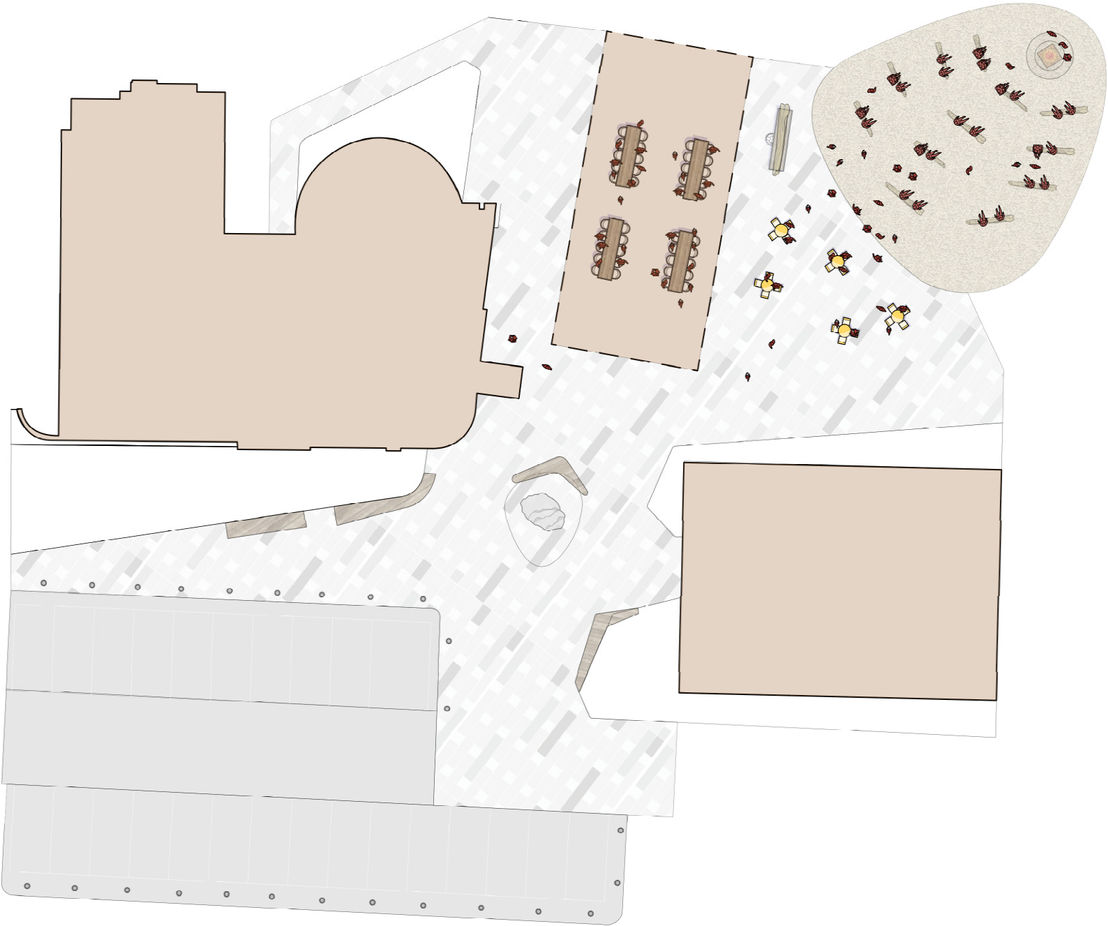
Community Event - 50-75 People