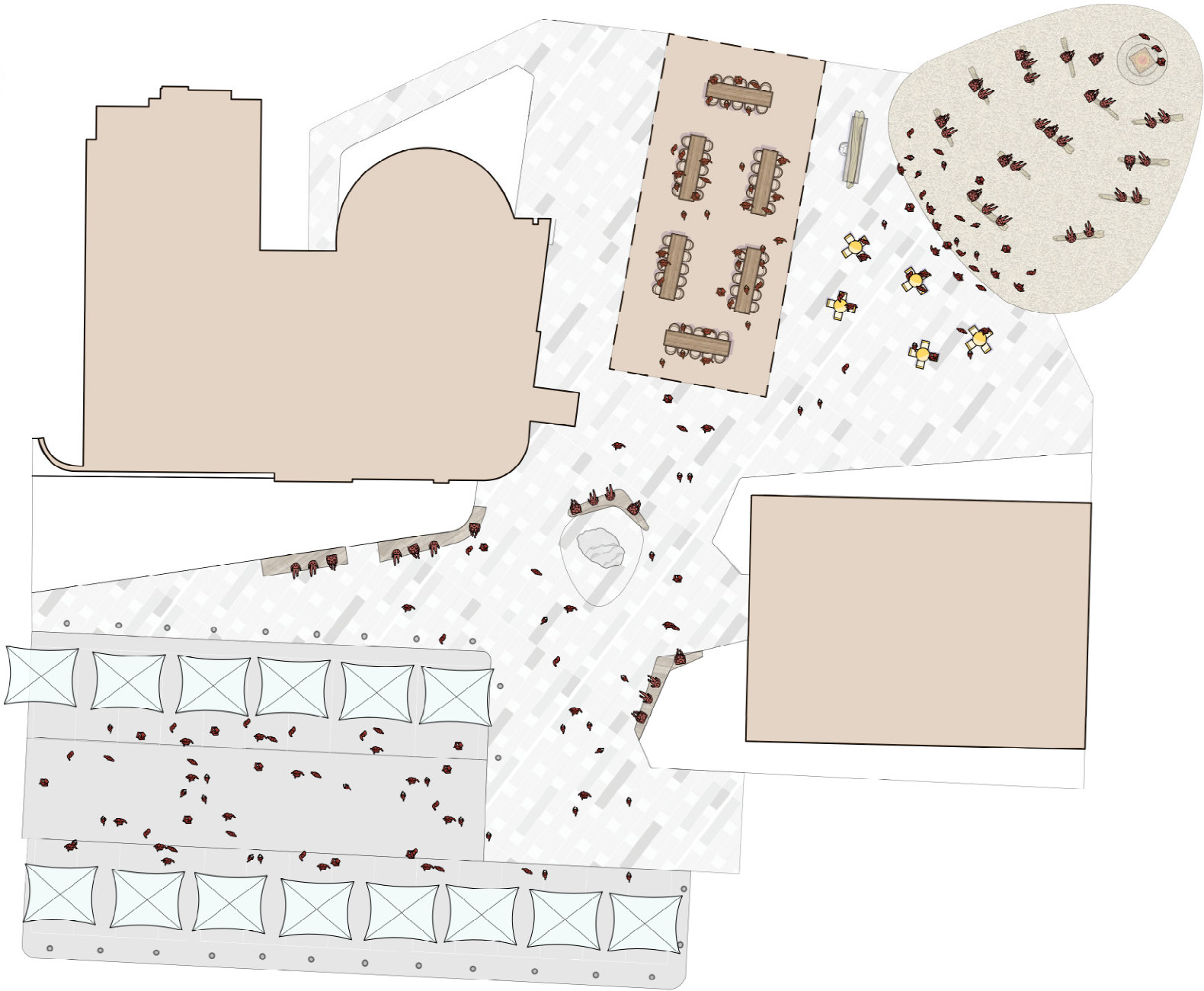
Large Event - 150-200+ People