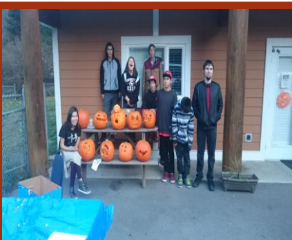
Above- Pumpkin carving for Halloween

A Boundary Review Committee meeting is being held on Dec.2nd @ 3:30 at Coquihalla Elementary school to bring forward any questions and concerns people may have regarding the draft transportation policy #7700.